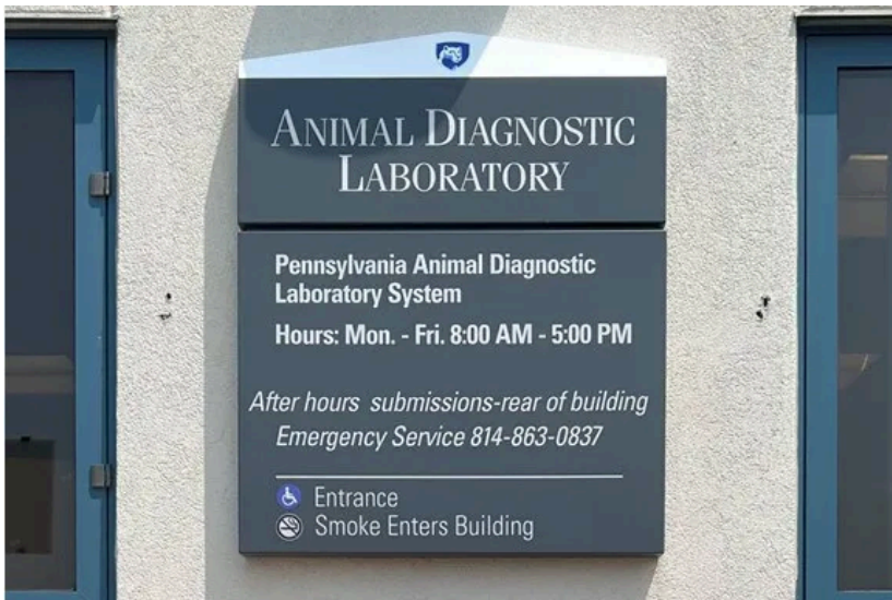
The ADL is located at 131 Pastureview Rd, University Park, PA 16802.